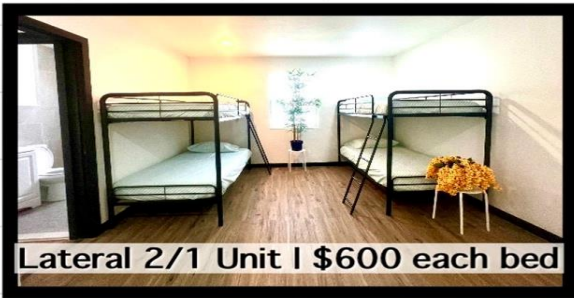
Lateral 2/1 Unit | $600 each bed