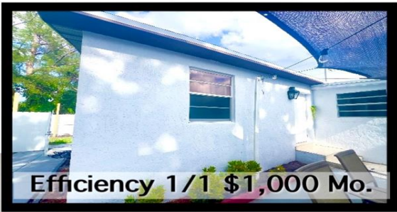
Efficiency 1/1 $1,000 Mo.