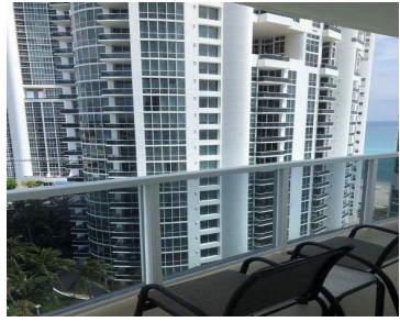
/ 57 Living Room

A11678240 © Miami MLS® 2024 A11714199 © Miami MLS® 2024