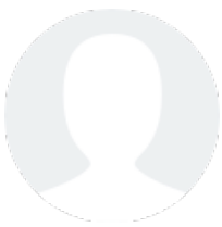
Fernando Lima Partnership Realty Inc.