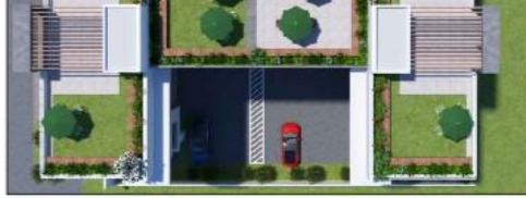
ROOF TERRACE VIEW 1 SCALE: N.T.S.