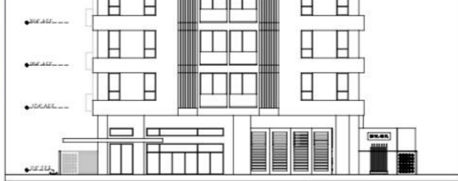
FRONT (NORTH) ELEVATION SCALE: 1/8"=1'-0"