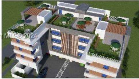
ROOF TERRACE VIEW 2 SCALE: N.T.S.