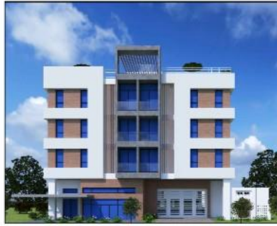
COLOR FRONT (NORTH) ELEVATION SCALE: N.T.S.