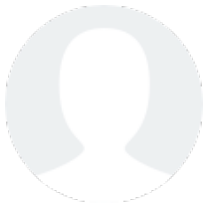
William Brothers Cervera Real Estate Inc.