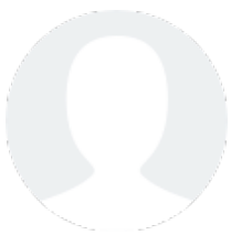
Zahira Galvez The Keyes Company

Ready to own a slice of paradise. Located in one of the most desirable neighborhoods in Homestead. You can either build new home or grow your crops. This 1.5-acre vacant, that comes with a green house, new septic tank with a Lift station, updated irrigation system and pump, Storage 12x20 included with the sale. RV [...]