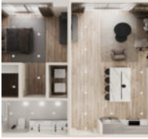
1 Bed/1 Bath