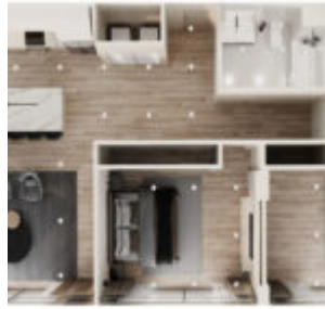
2 Bed/2 Bath