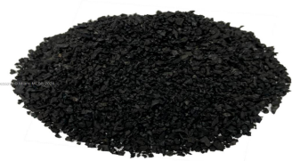
A11635275 © Miami MLS® 2024